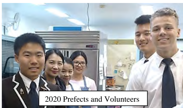
2020 Prefects and Volunteers

Also, thank you very much to our SRC boys and new Prefects for helping out at the Canteen. We would not be able to cope without them and greatly appreciate their assistance.