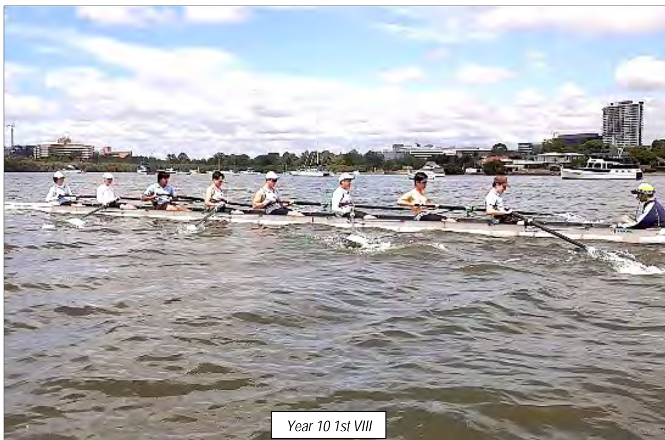
Year 10 1st VIII