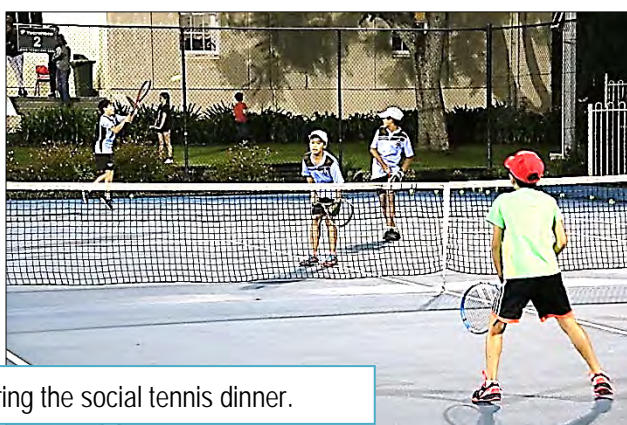
Tennis boys having fun during the social tennis dinner.