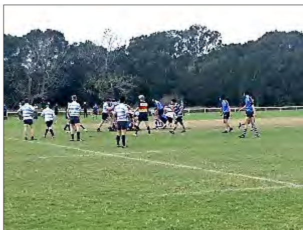
3rd XV at the breakdown