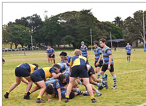
1 st XV at the breakdown