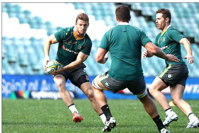
Wallabies in training before Bledisloe 1

In a sharp break from tradition, Wallabies coach Michael Cheika said the game had been added to the pre-Bledisloe preparation to get his players more game time between the end of Super Rugby and taking on the All Blacks at ANZ Stadium on August 18.