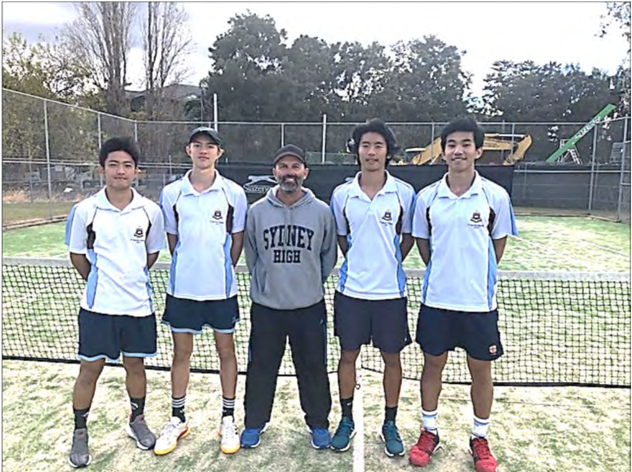
Stan Jones Cup Team:

Congratulations to our Stan Jones Cup team taking the win in the 1 st round of the Stan Jones Cup after 2 days of competing. A step closer to defending the title.