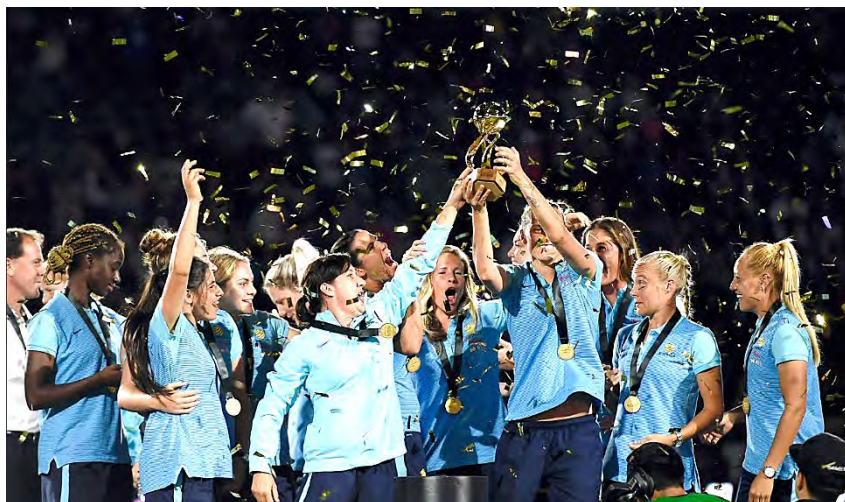
The Matildas celebrating their win as Tournament of Nations Champions