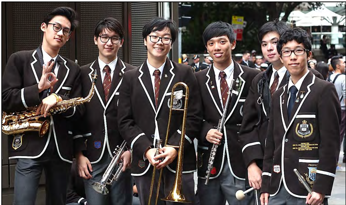
SBHS Ex-Students (Left to Right)