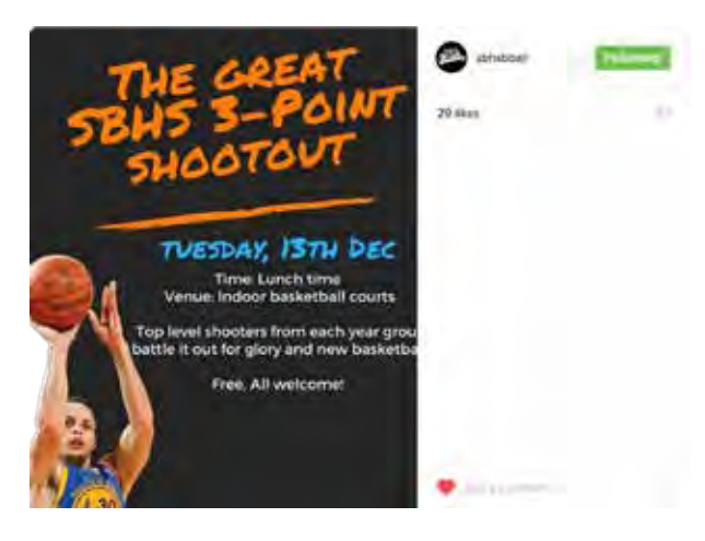
For more, visit @sbhsbball on Instagram

Congrats to First grade for coming fourth overall in the 20 Years Div 1 in CHS Nationals Basketball. Brilliant effort considering the age group they were in. What's more is that all our players are eligible to compete again next year. Maybe we'll see a podium placement in years to come.