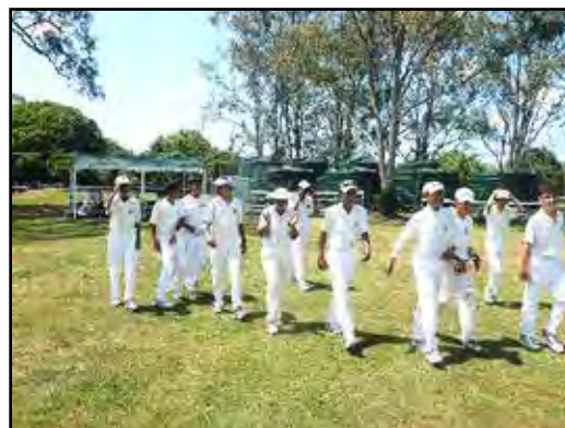
Year 8s walking out to bowl

On the Tuesday, the boys played a quick game of T20 to finish the day early. This allowed them some free time to take a tour of the Brisbane State High School, then head down to South Bank where there is a man-made beach to swim for the remainder of the afternoon.