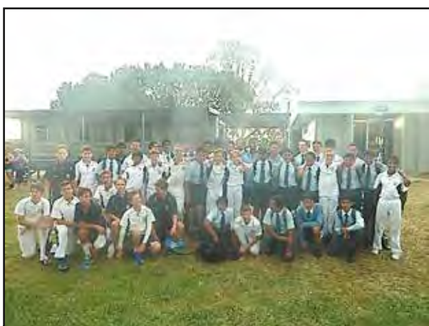
Year 7 and Year 8 SBHS and BSHS