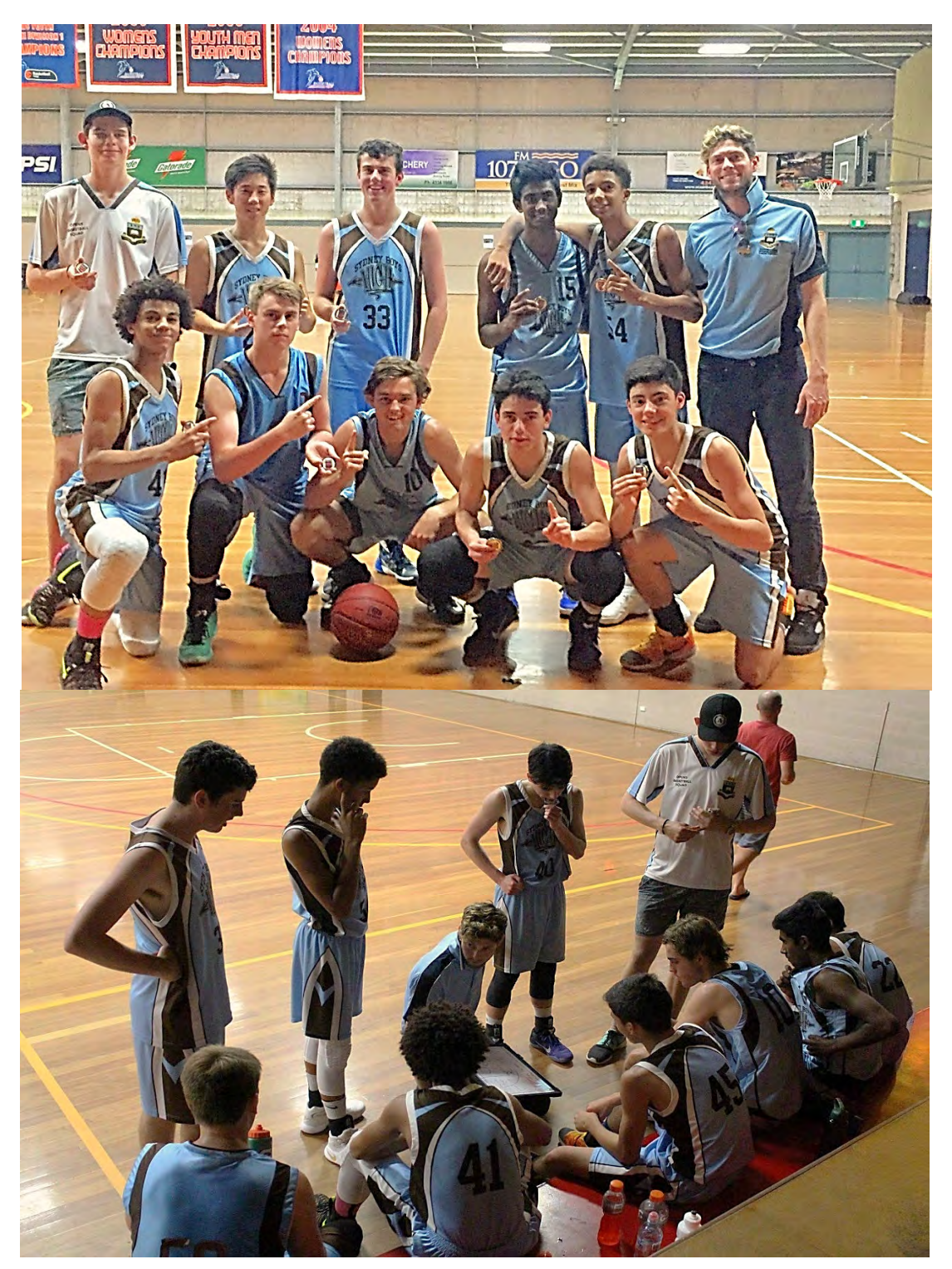
Top: U15s celebrate their win in the CHS State Competition. Bottom: U15s in the group huddle.