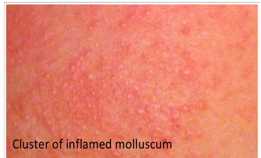
Cluster of inflamed molluscum