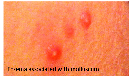
Eczema associated with molluscum