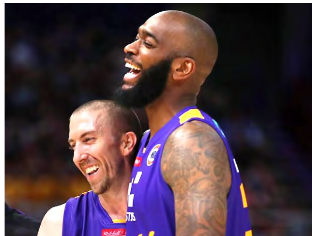
Steve Blake (left) and Josh Powell enjoy a good laugh during the game against the Bullets on Sunday.

Now tuning to the world of the NBL, where the Sydney Kings beat the Brisbane Bullets to make it five wins from 5! Former Los Angeles Lakers Steve Blake brought a wave of excitement through the NBL, where he led the Kings to an impressive 97-78 win. The Kings are also now the NBL tittle favourites, which is a great redemption from last season's disappointing end. The Kings avenged their first-round loss to the Bullets to record their fifth straight win in the club's best start to a season since 2007. This is a huge feat!