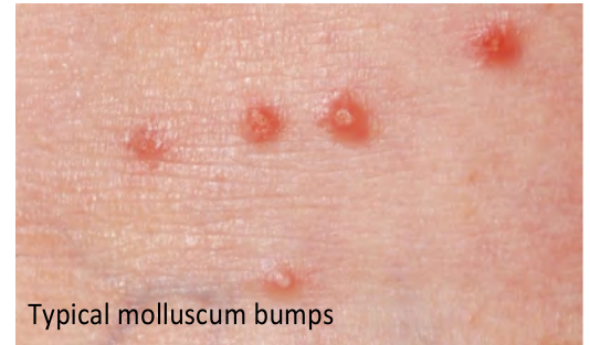
Typical molluscum bumps