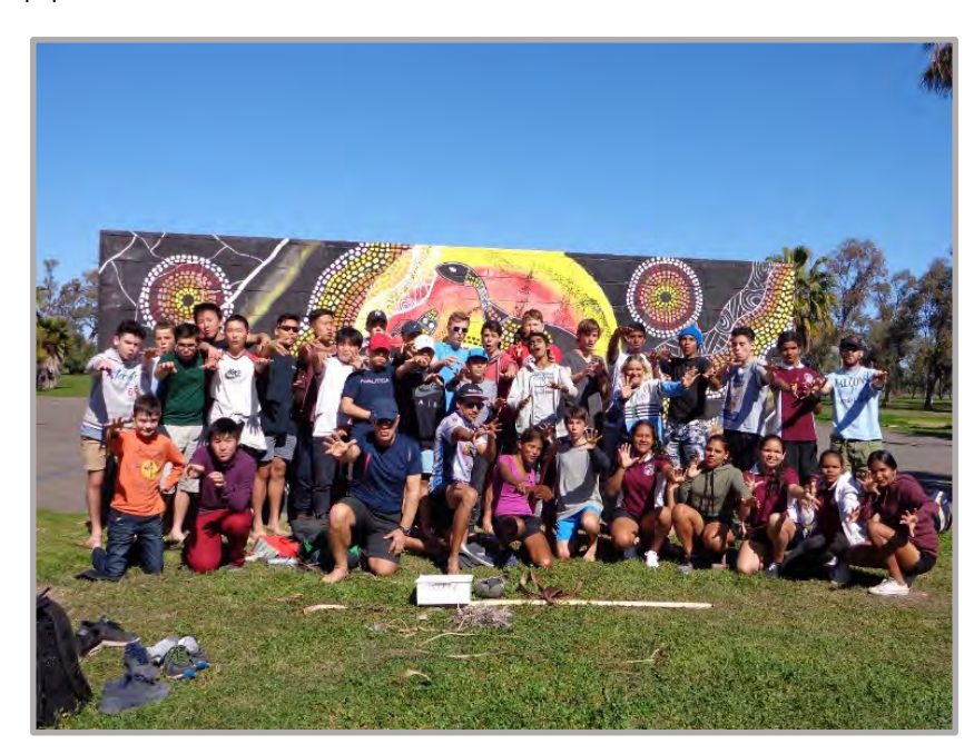
After our dancing