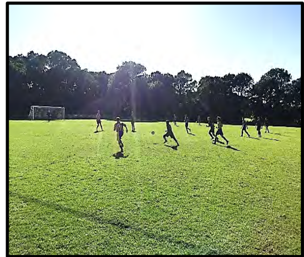
BHS 2 nd XI v's St Pius 2 nd XI at McKay 4

2016 Football Season has officially kicked off with our 1 st and 2 nd XI having their first hit out against St Pius. This was a good match up to start the season. In the past usually our teams are behind in both skill and fitness level. It was encouraging to see that our skill level was stronger than our opponents, but our lack of fitness ultimately was the result of our downfall. The 2 nd XI played very well and had open shots on goal, but was unable to capitalise. It was a great sight to see our boys create chances and play an attacking style of football. The 1 st XI was very similar with their only downfall being their lack of match fitness and awareness causing a couple of mishaps in defence. We believe we have a very strong squad this season and I am sure with some hard work we will have a successful season.