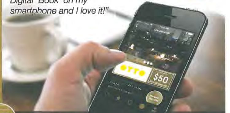
The entertainment Digital Membership

"I have the Entertainment™ Digital 'Book' on my smartphone and I love it!"