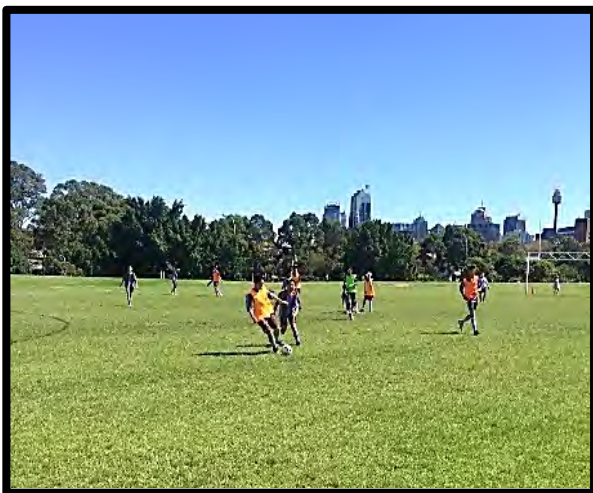
U14s Internal Trial

All other teams played internal trials and it was positive to see everyone turn up and play with the purpose of wanting to make a higher team. The sight of families supporting from the side line is great for SBHS Football. Students enjoy playing in front of their families and friends and the more support we get the harder our boys play. Teams will always be fluid so boys should want to improve and make a higher team with the ambition of playing for the 1 st XI in the future. We have a long season ahead of us allowing the students plenty of time to improve on their game.