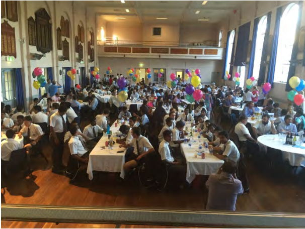
250 people turned out to a very successful End of Season Cricket Dinner