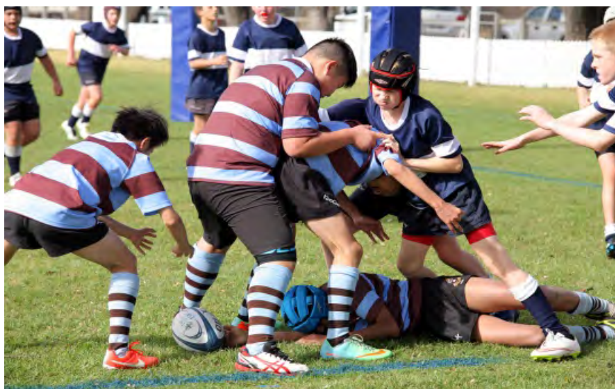
Figure 2- good open play sets up the backs with great ball to work off.....