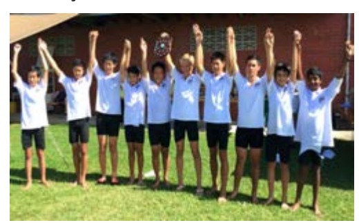
U15 SBHS Quads win gold and bronze medals at CHS Regatta

winning the CHS Schoolboys Point Score Trophy, a great effort by all.