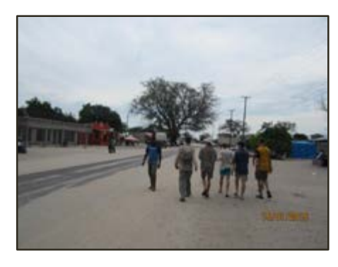
A view of the sandy village from the main road

relaxing save for the many potholes, and I slept in and out of views of lush trees and grasses sweeping by and school walking kids beside the road.