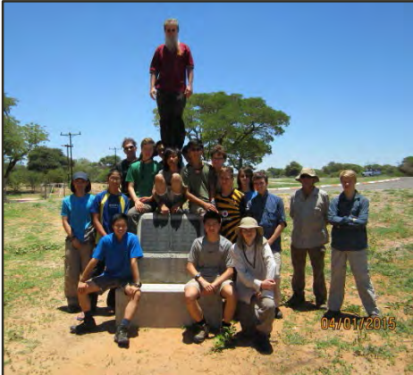
Group photo at the Tropic of Capricorn

Limpopo River, one of the largest rivers in Africa, was quite a spectacular sight. We travelled by bus from Gaborone for 5 hours to our first campsite at Dovedale, which was quite unique and isolated as people often didn't stop by there. Our first dinner, beef and vegetable stew, was full of flavour, enhanced by all the hard work we put in to make it.