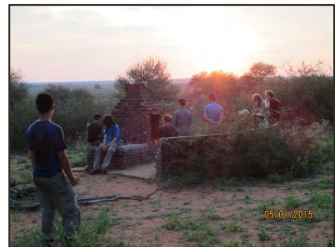
A view of our 2 nd campsite at sunset