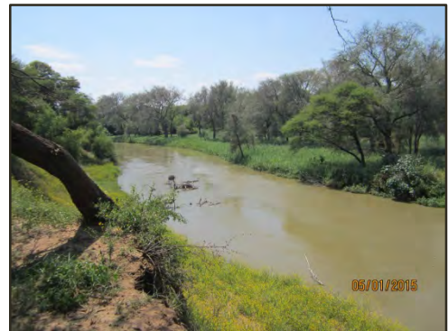
A view of the Limpopo River

ahead of schedule, with the last 4km stretch being the most unbearable. It was very hot, and the lack of shade on the trail made the walking tough. It was a real test of endurance, and all of us succeeded. We also attempted to cook some local foods, such as the local 'papata' bread. Our guide told us that we were the fastest group to do the hike he has led, which gave our group a huge sense of accomplishment. Luckily there was a small store at the last campsite, where we refreshed ourselves with all the drinks available. It was a good hike and everyone was ecstatic that they had pulled through such tough and demanding times.