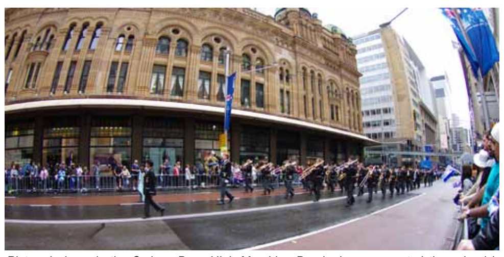
Pictured above is the Sydney Boys High Marching Band who represented the school in admirable fashion at the Anzac Day march in the city. The Sydney Boys High Marching Band placed second in the RSL ANZAC Day March Band competition – Junior Brass & Concert section.