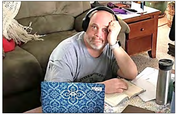
would mean a lockdown of schools. How does teaching and learning happen if there is a lockdown of schools and no one is there? ( Could we keep going if we had no one at school? I guess we could if everybody kept getting paid. )

Nobody knows what is going to happen. Schools should plan for the current scenario to continue into term two. There may be questions as to the sustainability of the model. 'Pace yourself for the long race'. ( Don't commit to too many full synchronous lesson deliveries on any given day. We have only set the baseline at one online interactive lesson per class per week. It is easier to have at least 5 – 10 minutes in that mode and move into other modes for many lessons. ) Stage 3 restrictions, if imposed,