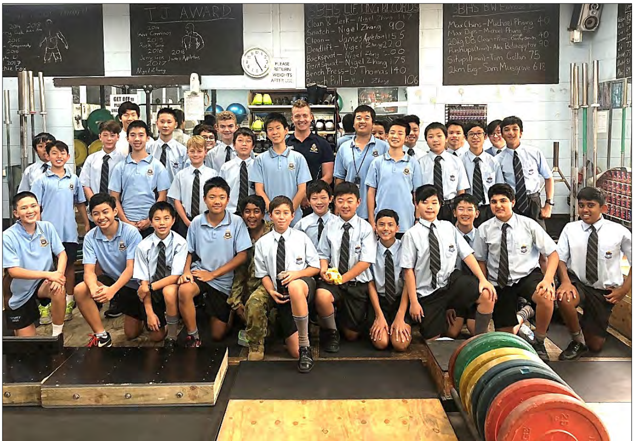
Year 7 Weights Room Members 2019