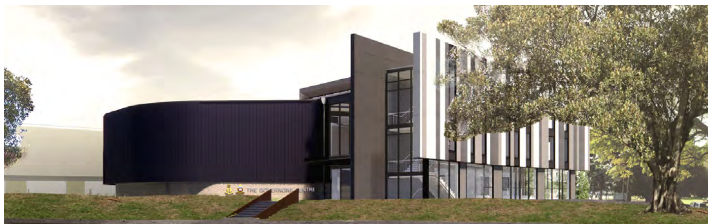
Artist impression of The Governors Centre