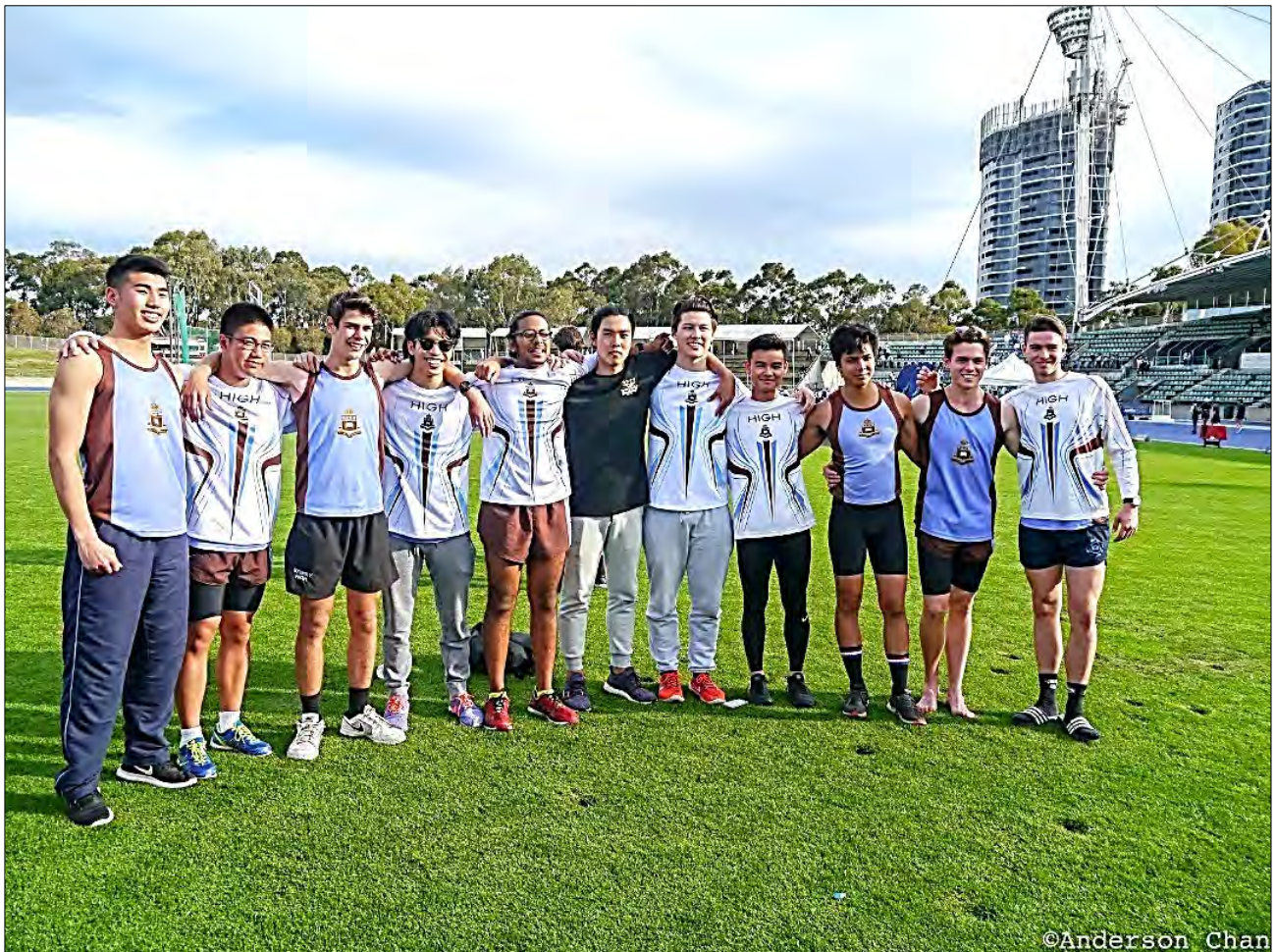
Year 12's of 2018 at the conclusion of the GPS Athletics Carnival