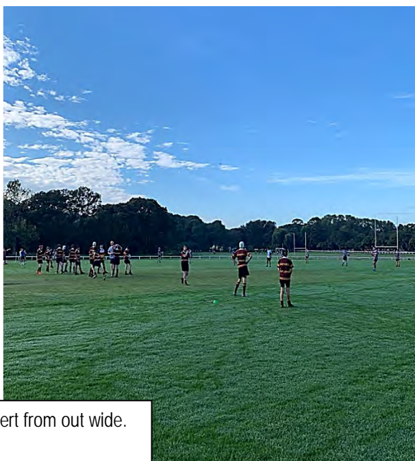
Left- Saxon attempts to convert from out wide.