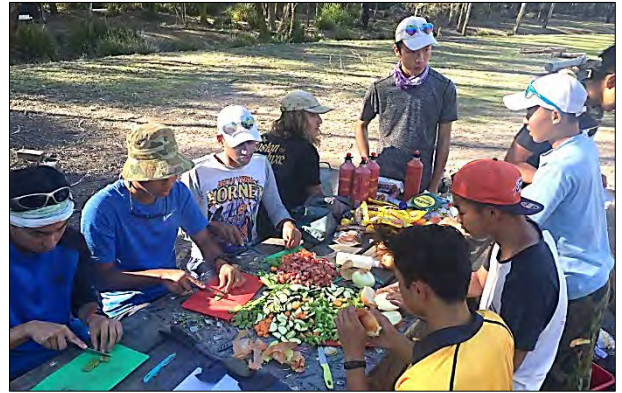
Preparing the evening meal