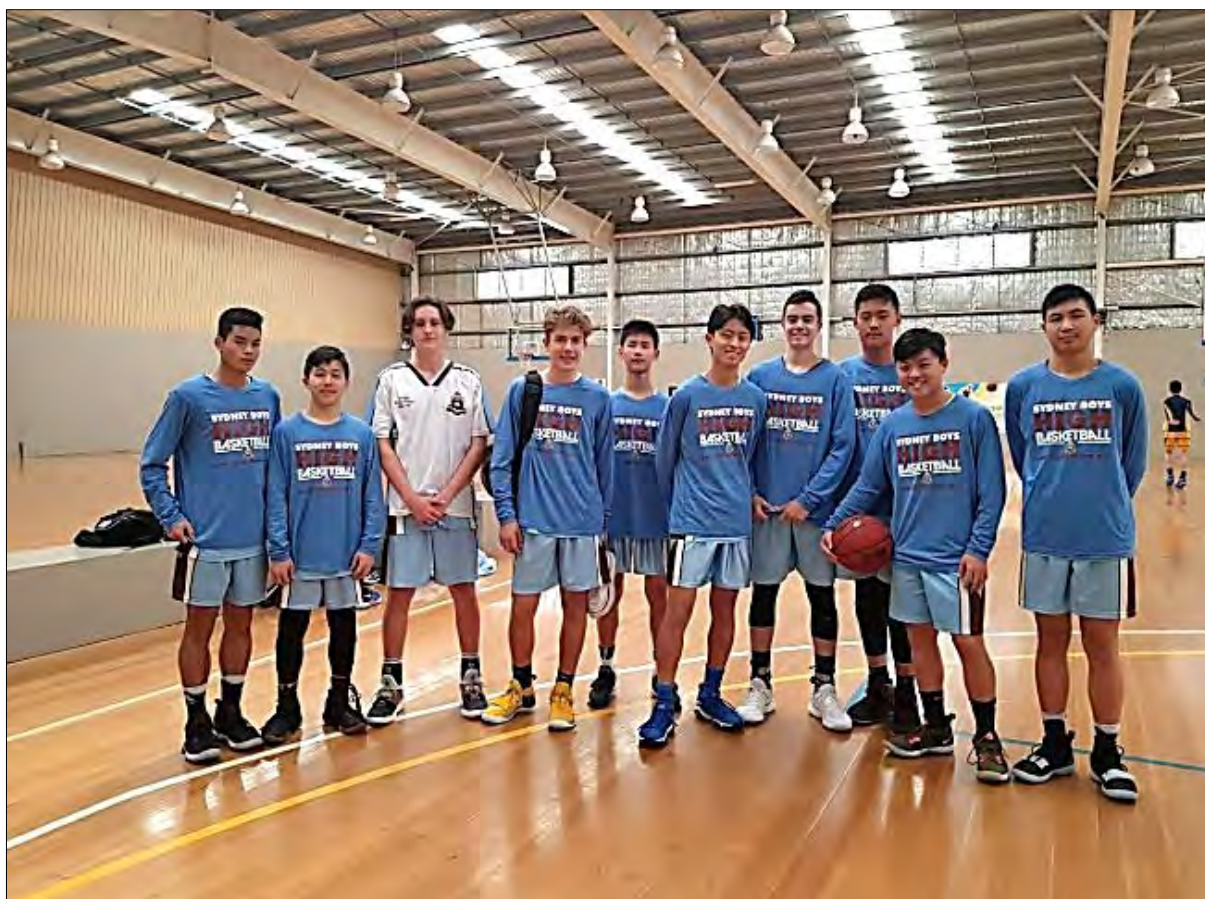
The 15s CHS side at the nationals