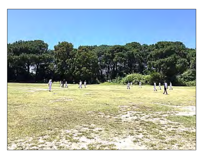
The 14Bs team against Scots