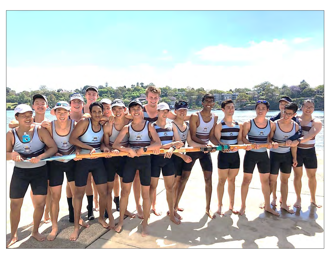
Current 1st VIII and old boys VIII arguing over the winner's trophy