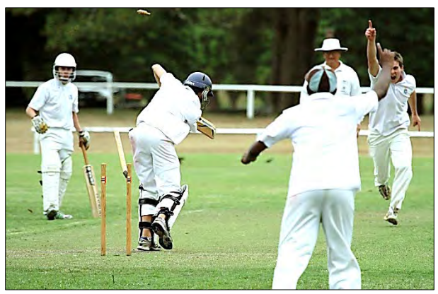
Archival Photo SBHS 2010