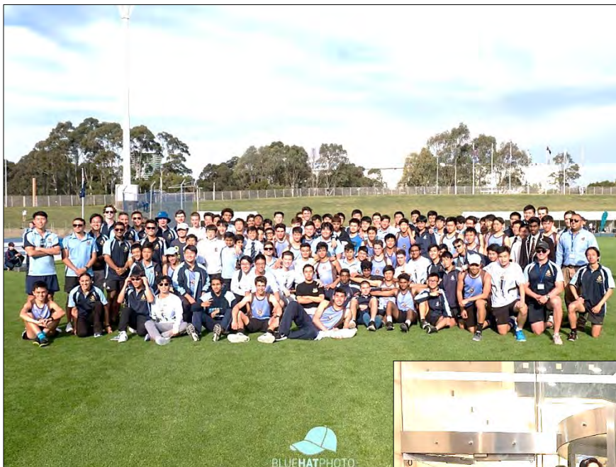
2018 Squad Photo