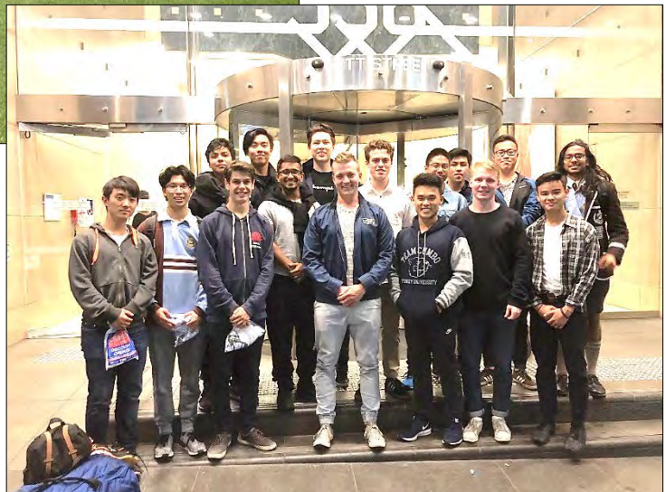
Year 12 & Coaches Dinner