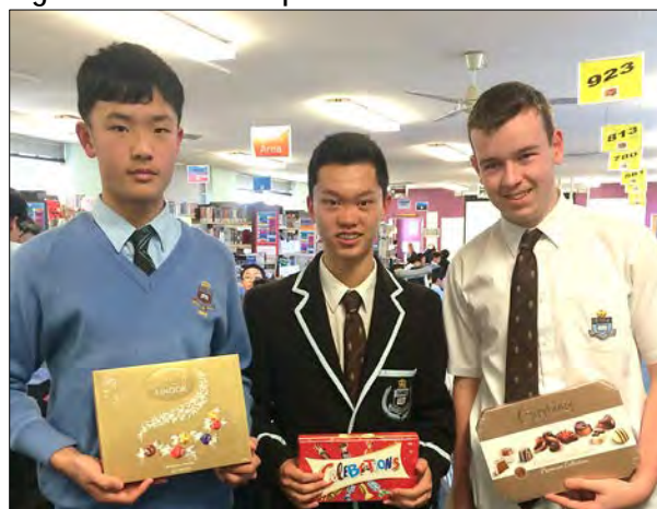
Winners with their prizes