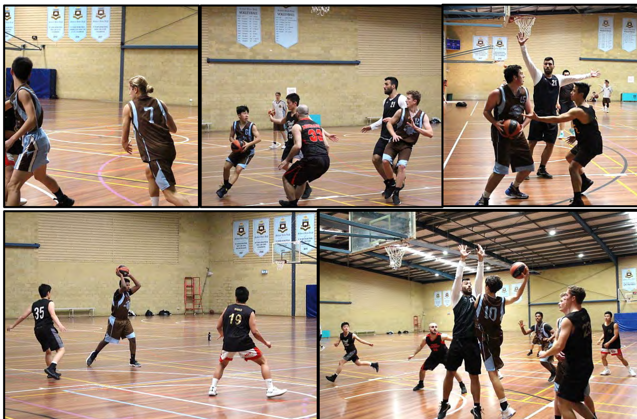
Above: 2nd grade basketball