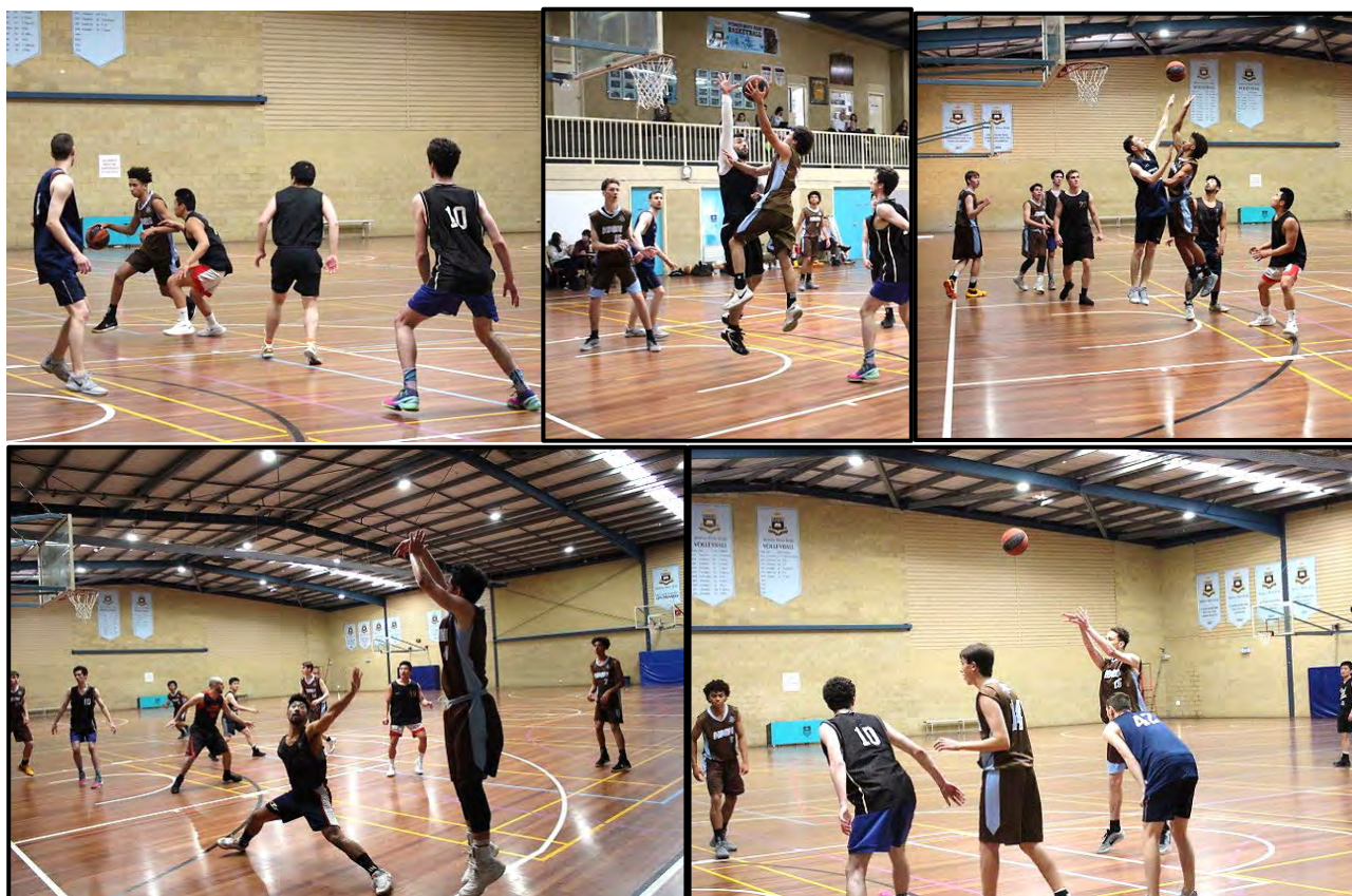
Below: 1st grade basketball