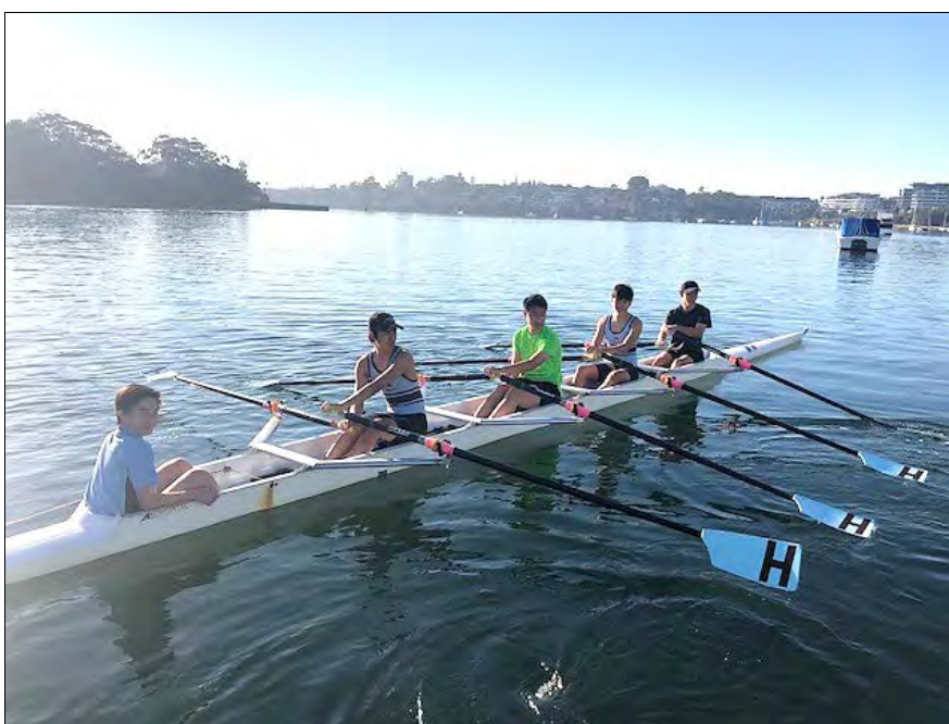
The Social group in their first crew experience

Week 10 Term 4 marks the start of training for all rowers as the Athletics season has now finished. For junior crews and Year 10 Vllls week 10 will include some testing at school and on water rowing during sport time.