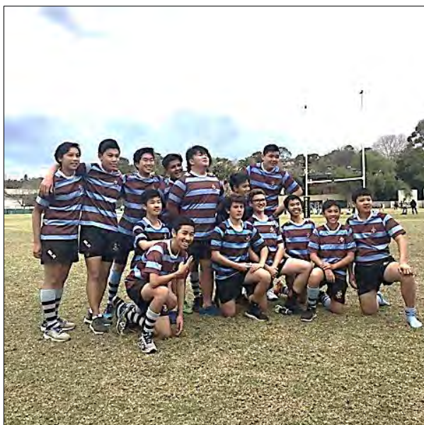
A proud 14A's after their match