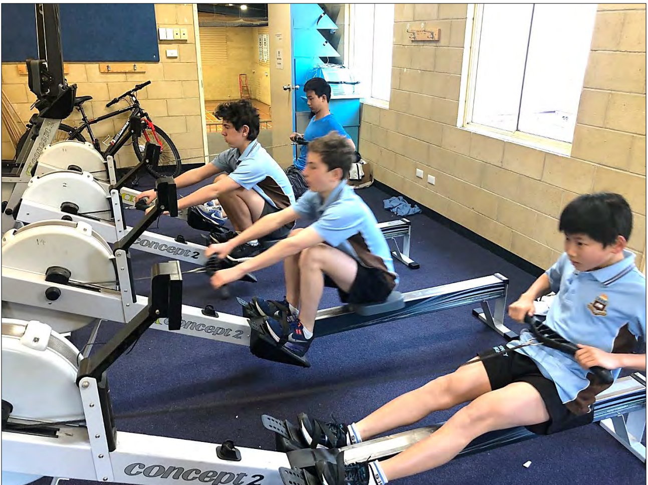
Year 8 boys attending off season erg training