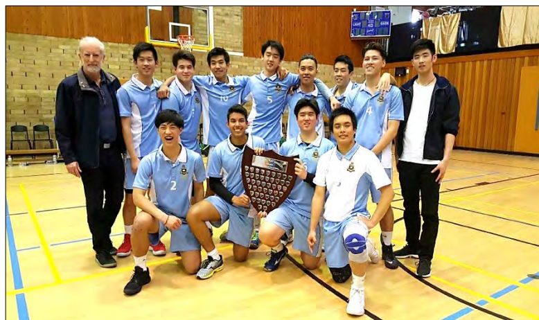
AAGPS Volleyball Undefeated Champions 2018