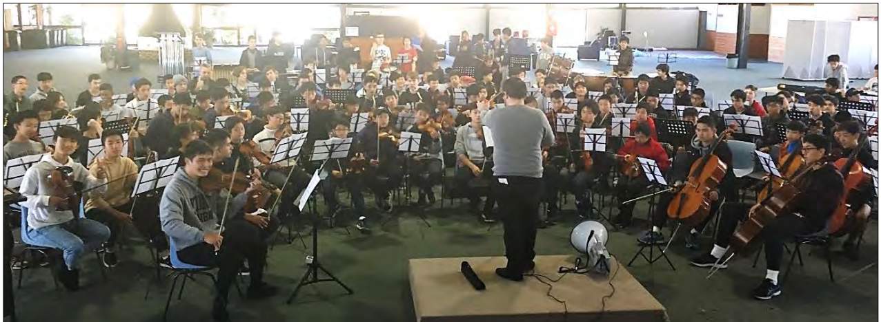
Combined Rehearsal Day # 1 at Music Camp