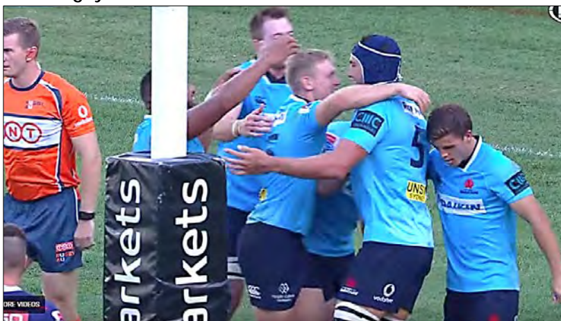
Waratahs celebrating another try against Melbourne Rebels last weekend.