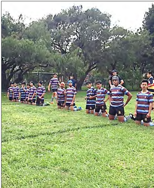
14As boot inspection pre-game