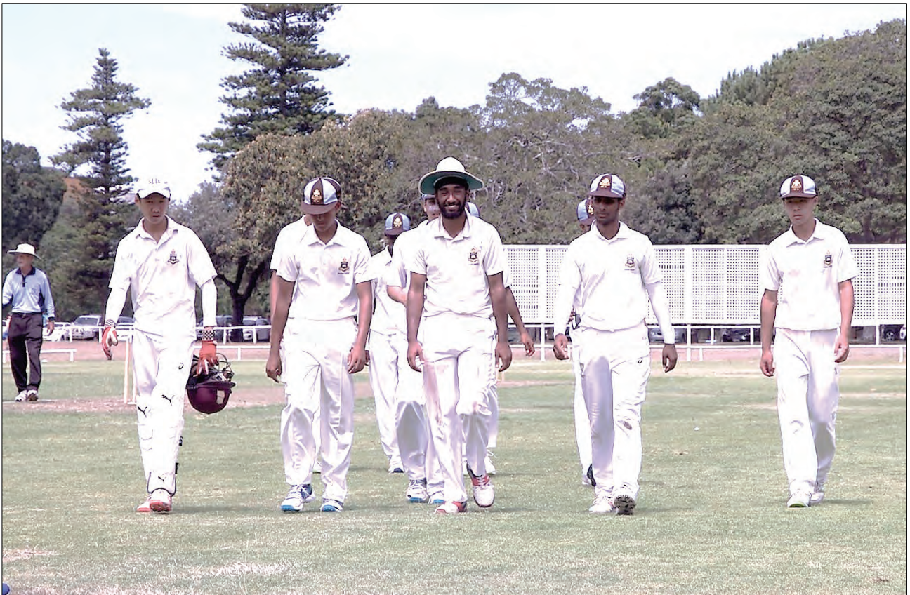
1 st XI after their bowling innings