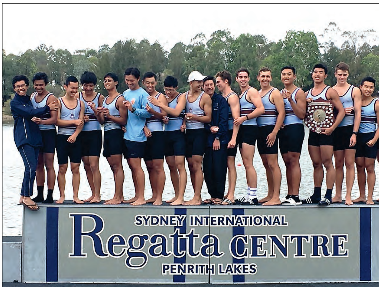
1 st and 2 nd VIII – Medal presentation for the VIII's race