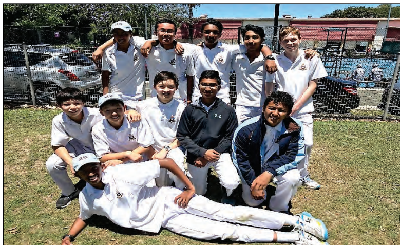
16Bs after their resounding victory