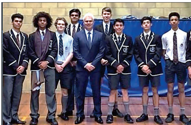
Shane Heal with the Firsts

Last week during the summer sports assembly, we were honoured to have Shane Heal as a special guest speaker. Heal is a four time Australian Olympian who played for the Timberwolves and Spurs in the NBA, and the Sydney Kings in NBL who were led by Heal to a national championship. Thank you to Shane Heal for taking time out to speak to our first grade boys. We're sure he is a huge inspiration to all who met him.