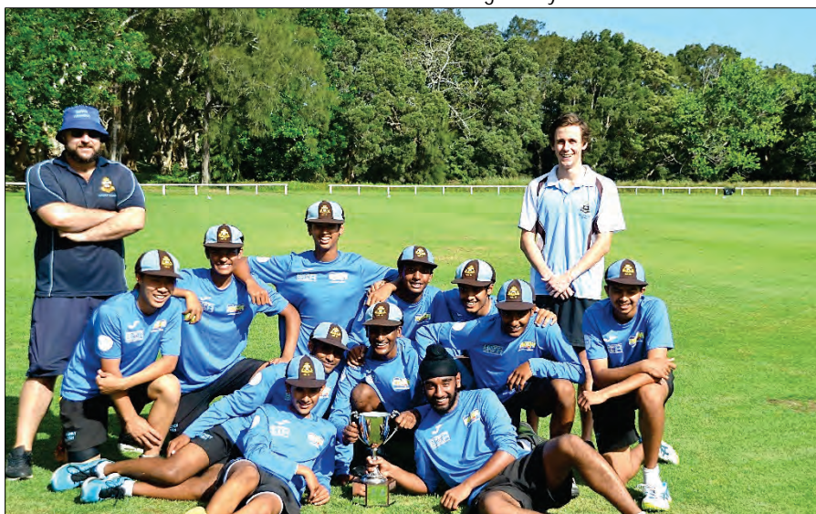
1 st XI with the Joseph Coates Trophy