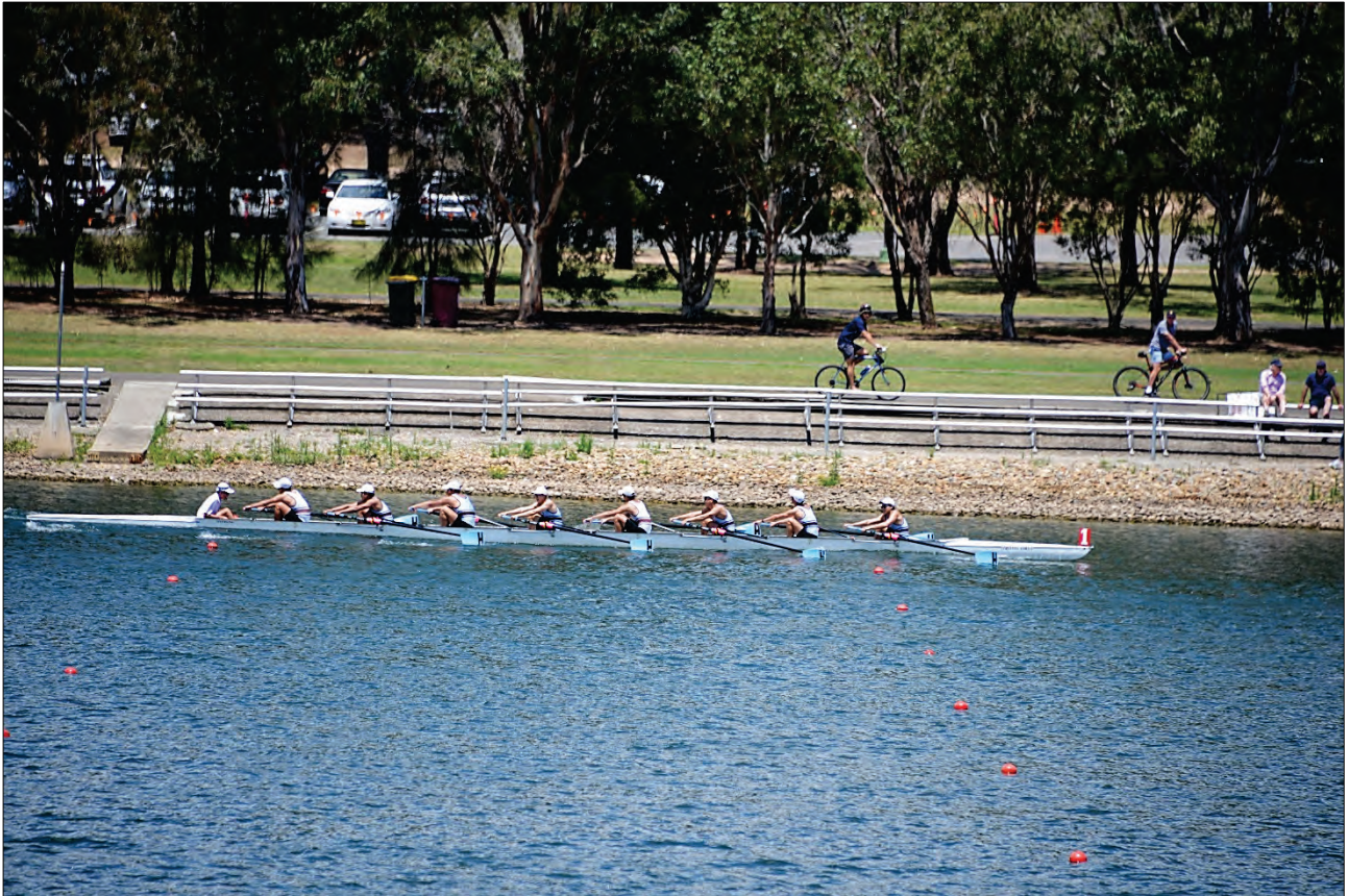
2 nd VIII finishing strongly to beat Grammar