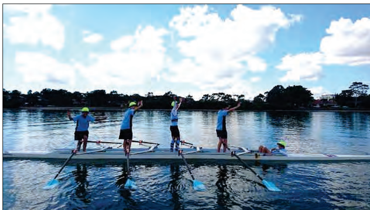
Year 8 2 nd Quad posing