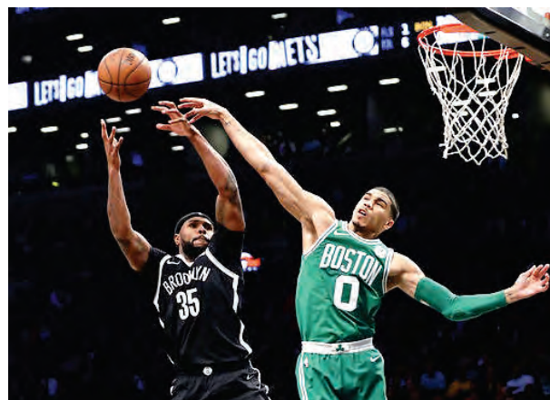
Boston Celtics' Jayson Tatum (0) blocks a shot by Brooklyn Nets' Trevor Booker (35) during the first half of the game played in New York on Tuesday.

See the following page for the results table