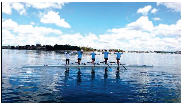
Year 8 1 st Quad posing