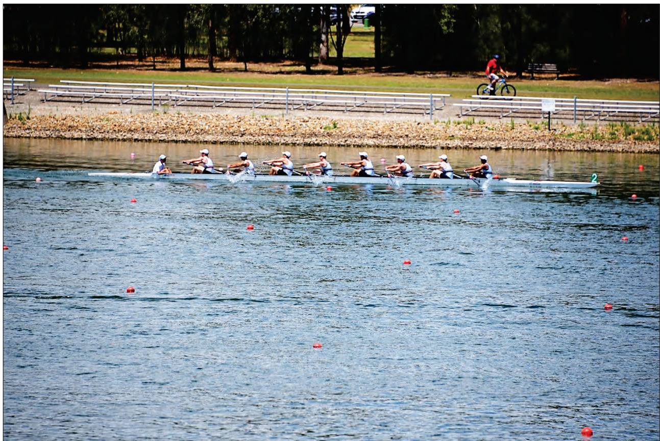
1 st VIII during race 2 of the weekend