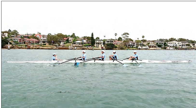
A Year 7 crew in their third session on the water