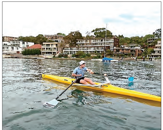
Year 7 scullers trying out the new wave cutters