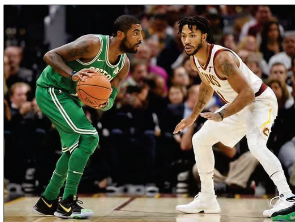
Celtics guard Kyrie Irving (11) works against Cavaliers Derrick Rose (1)