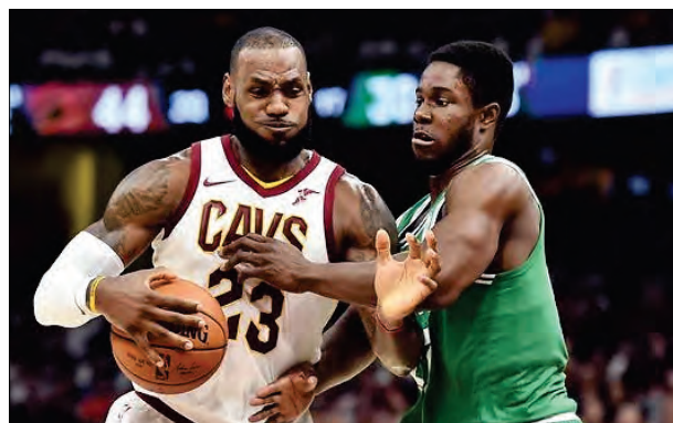
James (23) drives to the basket against Celtics forward Semi Ojeleye (37)

In the season opener, LeBron James' Cleveland Cavaliers triumphs in a close game at home against the visiting Boston Celtics 102-99