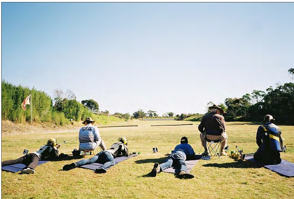
GPS Shoot at Hornsby Rifle Range