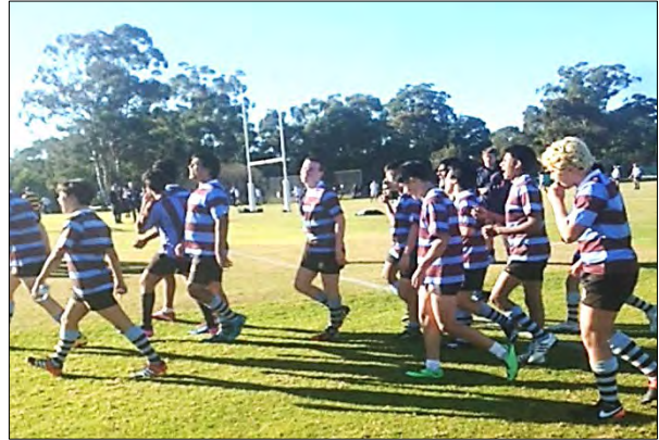
16Bs celebrate one of their greatest comebacks!!

This week, the 2nd XV had a very close game against Kings 7th XV. Coming down to the wire on a tight contest that tested the limits of both our attack and defence. The 22-19 victory came mostly from the second half, where we became much more dominant in attack. We had let them under our defences in the first half, our mistakes allowing them to sneak in two early tries. But an amazing try by the captain, coming in from the 22, served to even up the score slightly. We slowly increased our speed in attack and found gaps in their defence, resulting in two fast tries almost under the goalposts. Even though failing to convert them, we pressed on. Now only four points behind, we were suddenly in the game. Closer to the try line, Tushaya found a gap in the play and running in a try putting us up one point ahead. Nick Liang was able to convert the try which put us in a three point lead to win the game. 2nd grade worked extremely hard to stay in the game when all hope seemed lost, and it paid off in those last few minutes. With only three games to go, I hope we can go on to be one of the most successful sides High has seen in years.