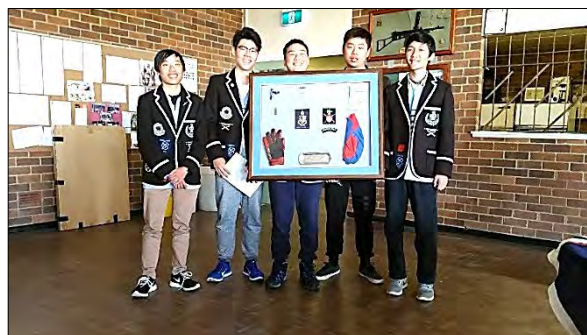
All Schools Match Winners holding the Fiona Reynolds Memorial Trophy