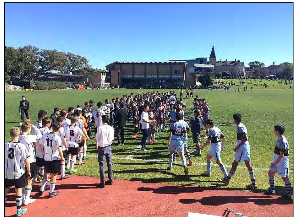
2 nd XI running on against Newington

The 14Es also remain undefeated with two wins and three draws.