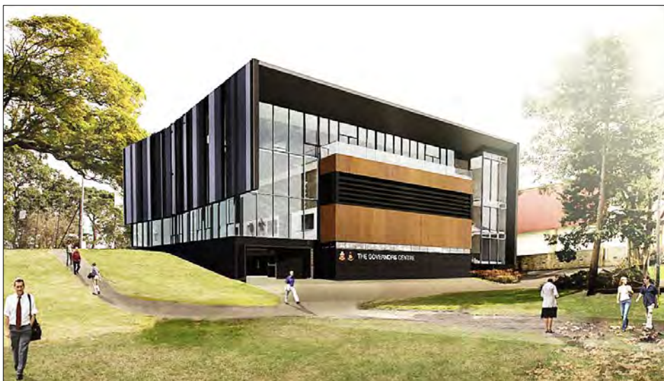
The Governors Centre (Architectural Impressions)