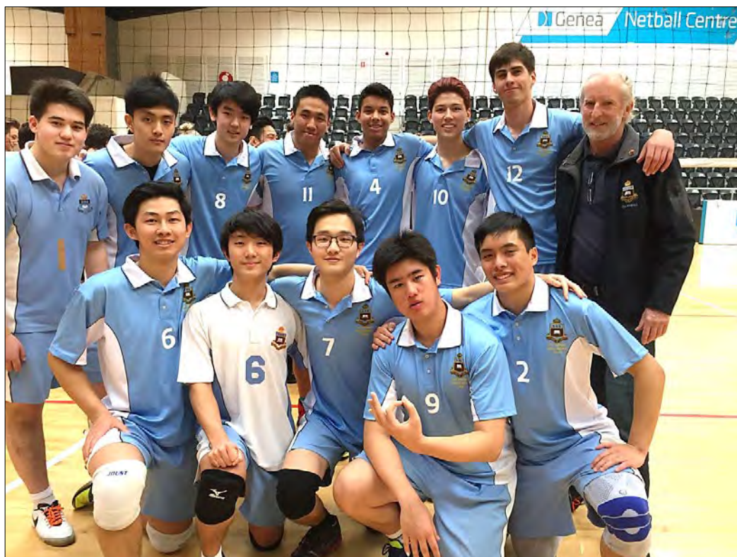
1 st Grade Volleyball - CHS Knockout Champions