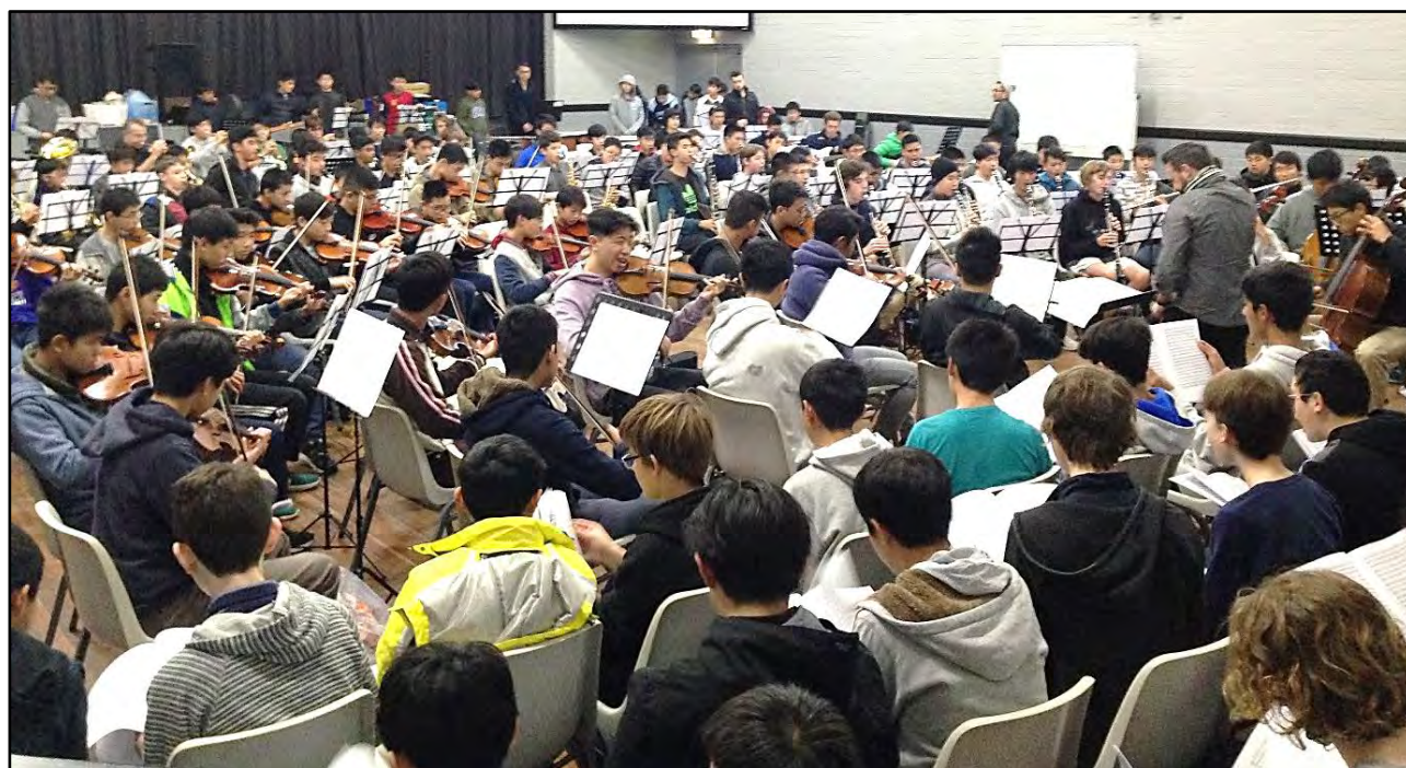
Combined Ensemble rehearsing in the Auditorium at the Collaroy Centre on Wednesday 31 May

The Music Department would like to thank all students and staff for helping out at Music Camp. Big thanks goes to Year 12s! We wish you all the best of luck for your HSC!