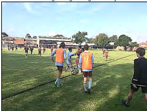
SBHS celebrating their golden goal victory

SBHS 1 st celebrating their golden goal victory