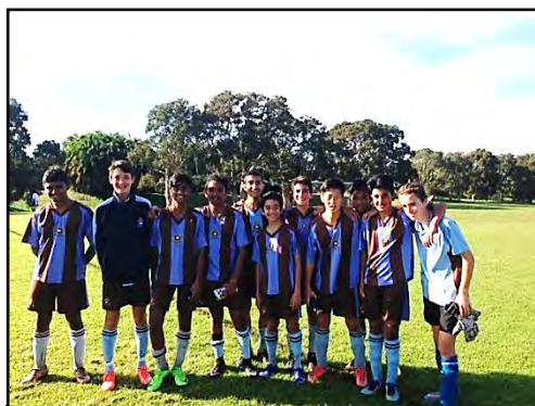
15As celebrating their first win

After 2.5 years, over 25 matches, the mighty 15As have finally notched up their first win ever for the school. The boys were dominating the whole match, but conceded a goal just before half time to be down 1-0. They believed in themselves and fought hard to take the win 2-1. This comes off the back from a draw from the previous week. The team trains hard and are determined to perform well. We believe they may surprise a few teams this season.