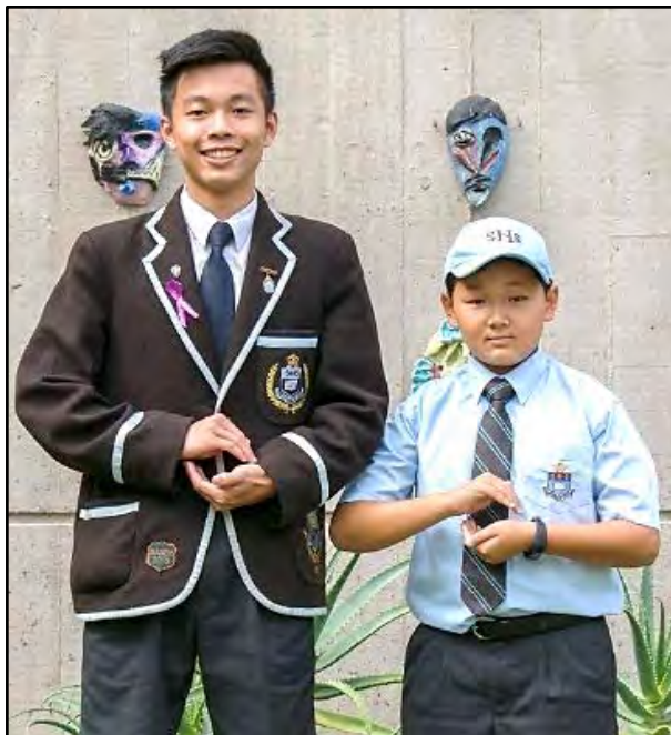
"From little things, big things grow"- Industry Superfund

The Industry Superfund ad is a very relatable analogy to my experiences at High. The ad progresses to compare two women who earn the same income, but one woman makes the change to an industry superfund instead of staying in an ordinary retail one, reaping greater superannuation funds for the future. High has been like my industry superfund. Entering high school as an unsure, timid person, High has paved the way for me to implement change through a wide range of opportunities; playing two GPS sports, participating