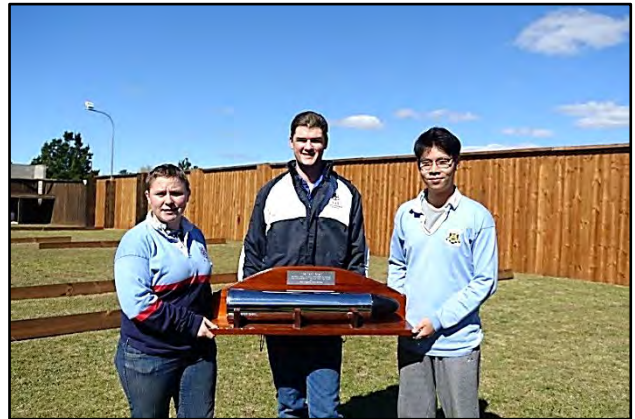
NEGS, TAS & SHS Captains of Rifles with The Tankshell Trophy