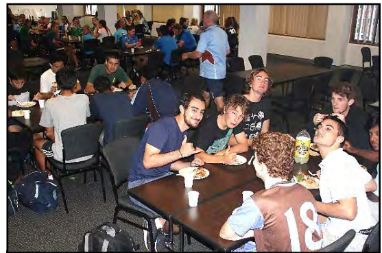
Lunch provided in the boarding facilities at VSP

Please ensure the following instructions are adhered to: