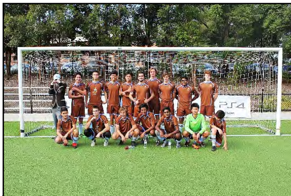
SBHS – St Andrews Cup Squad

The boys had a terrific time providing invaluable experience, exposure, fitness and most importantly, team bonding. The boys did very well making the Plate Cup group and finishing 8 th overall.