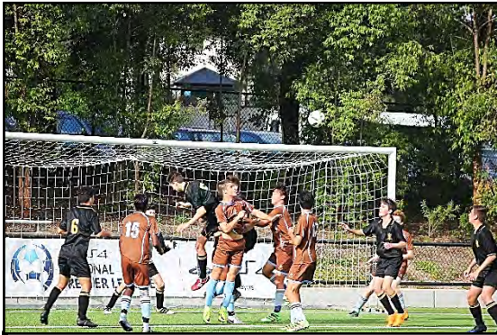
SBHS going up for a header against St Patricks

Also, in the second week of the holidays is the annual St Andrews Cup our 1 st XI get to participate in. This has grown substantially over the past few years to the point that FFA have now stepped in to sanction the tournament. The event was held at Valentine Sports Park. We decided to make the event more prestigious by having the boys stay overnight at VSP accommodation.