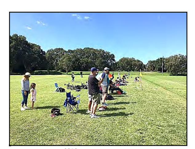
U13s parent support