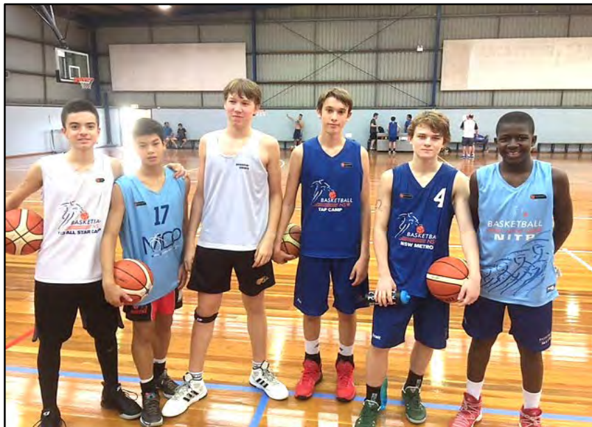
UNDEFEATED 15As take a break during training at ECC in Minto