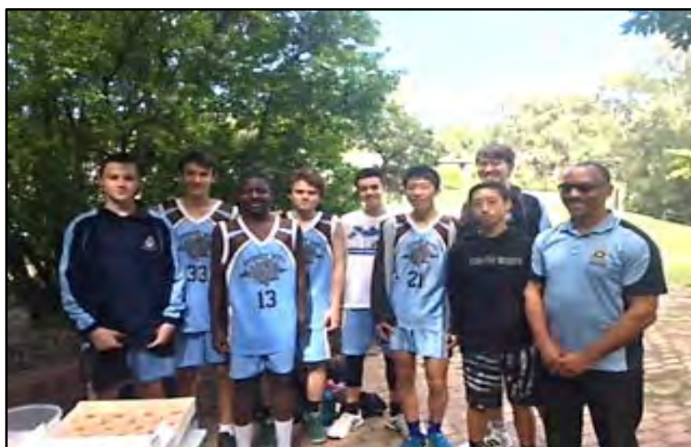
UNDEFEATED 15As at their post-game BBQ