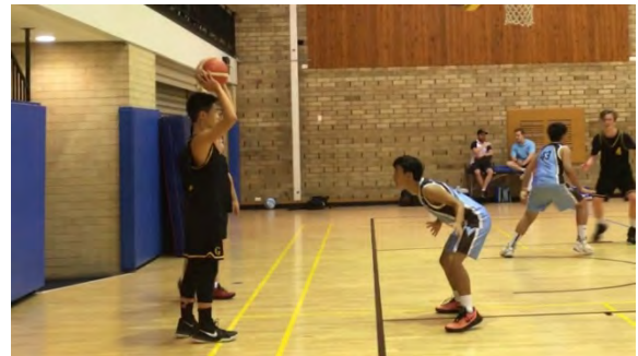
Rivalry in 15s