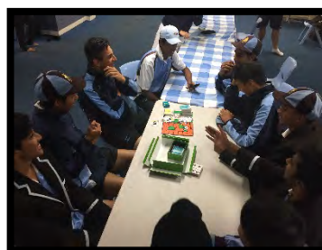
1 st XI having brunch and playing games

The 1 st XI match was abandoned upon arrival of our team. Instead of having the food the parents graciously prepare for the day go to waste, we thought it better if it gets eaten. So, we had a team brunch with players, parents and coaches and the boys got in a card game.