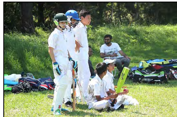
U14Bs waiting to bat against Joey's

We will be sending information about the End of Season Dinner in the coming weeks. But, for now please place the date Friday 17 March into your calendar for the event.