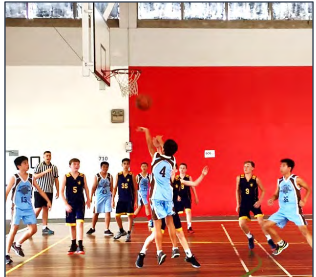
14B's hit a game winner!