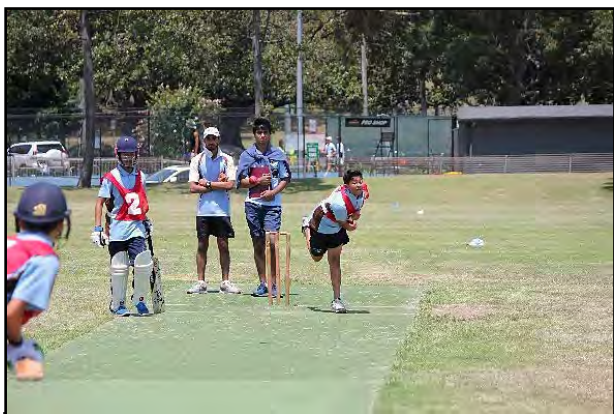
Year 7 try-outs

On Saturday, our new Year 7 students had try-outs for team selections. They all trained hard and made a strong impression with their enthusiasm, skills, and eagerness to impress. Our bowling looks very strong which is most promising for the future.