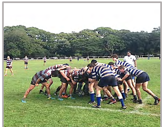
Figure 1- action from the 2XV game as they hook the ball back in preparation for another attack. They went down by just two points. A commendable effort!!