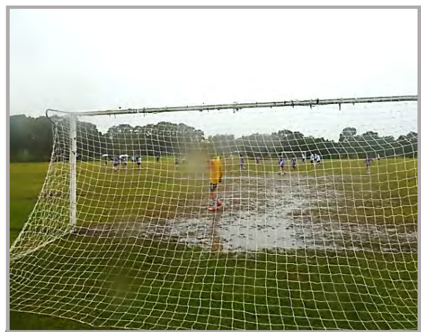
Wet and muddy conditions on Mission Fields

The result of the week goes to the 13As who won 1-0 with this being the first win for any A team for the season and the first U13As win since my time as MIC. Well done!!