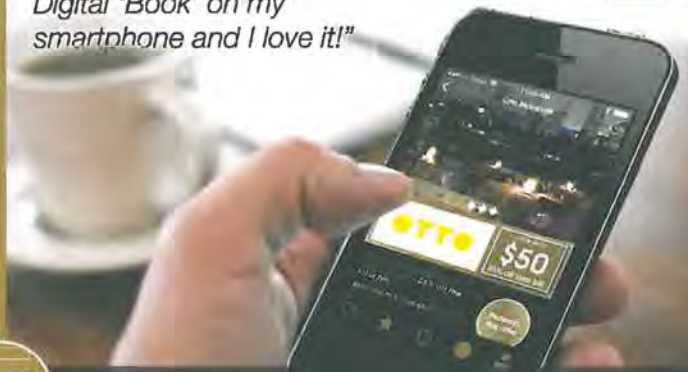
The entertainment Digital Membership

"I have the Entertainment™ Digital 'Book' on my smartphone and I love it!"