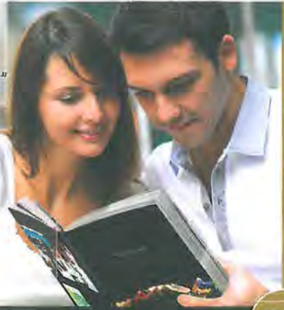
The entertainment Book

"I love this Book! I'm discovering places I have never been before."