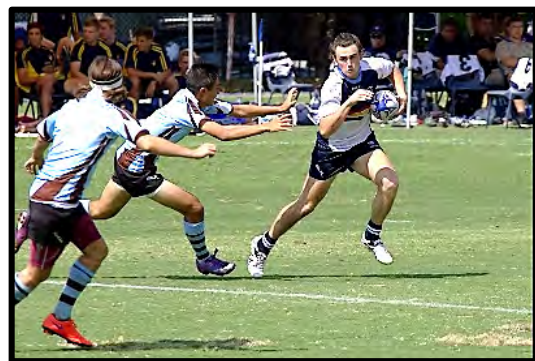
Sydney Boys vs Hunter Valley