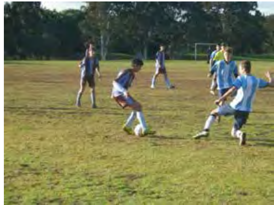
Nikhilesh Belulkar from the U15As

The U14s have shown a remarkable improvement. The A team last year lost 5-0 and within 12 months turned it around to win 2-1; similar to our 14Cs team reducing their deficiency by 9 goals. King's U13 age group is a very strong age group and our A team should be very proud of their efforts. They were only 1-0 down at half time and actually had many opportunities out wide with thanks to Kazi Hasan's speed. If we were able to capitalise on our chances I am sure the result could have been very different.