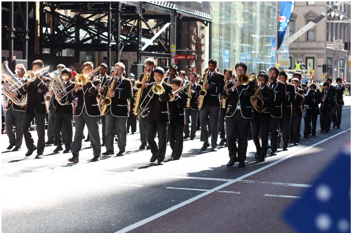
Sydney Boys Marching Band Anzac Day Saturday, 25 th April, 2015

Our Marching Band performed outstandingly last Saturday on the 100th Year Anniversary of Anzac Day in the city parade. Our boys marched 2 circuits along with many other marching bands including both professionals and high school bands. We were very fortunate that the weather held out for us on this very special occasion.