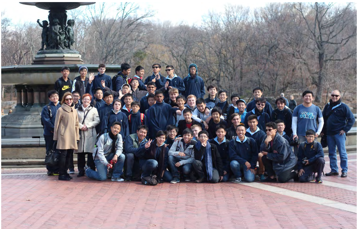
2015 USA Music Tour (Group Photo taken in New York)

Staff and students who went on the Music Tour to the USA in the April holidays arrived back on the Sunday morning before school started. The experience of performing overseas was invaluable and the boys had a great time seeing all the sights and exploring the four cities they travelled to: New York, New Orleans, San Francisco and Los Angeles. Some of the great highlights included performing in Central Park, visiting Alcatraz, the scenic coastal drive from San Francisco to LA and participating in a 2-day workshop with a professional conductor in Disneyland including a recording of the pieces they performed. The tour was a wonderful success and hopefully the boys arrived back home without too much jetlag. Thank you to all the staff and boys for all their hard work and parents for their wonderful support leading up to the tour.