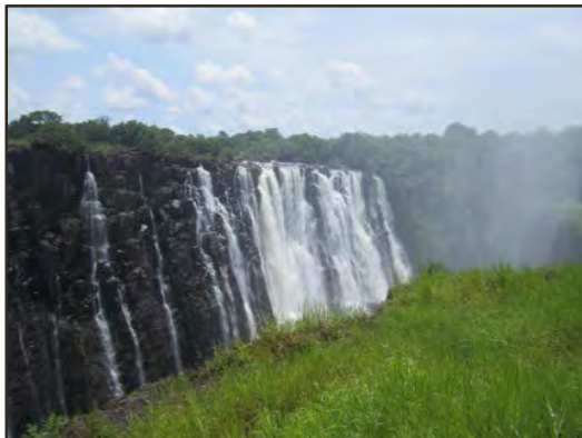
A view of the Victoria Falls

We also had great fun at Victoria Falls, especially during our great experience at the Devils Cataract. The initial experience of Victoria Falls was amazing, the tower cliffs and the water plunging over the edge as well as the spray soaking us like rain. However, after we had viewed it we decided it was time to get amongst the falls, and we went in with some locals to the Devils Cataract where we jumped from small waterfalls and had great fun in the pools alongside the edge of the falls.