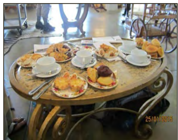
High Tea at the Royal Livingstone!

In the markets in the city we bought the local Chipolopolo football jerseys and watched the Zambian game against Tunisia with the locals. Finally, after a great last night out we got on the long flight home.