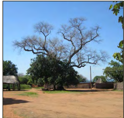
The tree under which David Livingstone was received, when he arrived at Mukuni Village

After our village work we caught a bus from Mwandi to Livingstone where we were set to spend the last few days of the trip with some free time. Upon arriving in Livingstone we had to find our way to the Jolly Boys accommodation, getting assistance from locals who seemed to know where we were headed before asking. While in Livingstone we enjoyed a classy high tea at the Royal Livingstone hotel where wild zebras casually strolled along the lawn! This place also had amazing bathrooms with ice in the men's urinals.